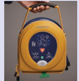
2.4 lbs. light.