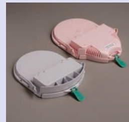
Pad-Pak™ and Pediatric-Pak™ with pre-attached electrodes

Low cost of ownership. Cartridge has a shelf-life of 3.5 years from date of manufacture, offering significant savings over other defibrillators that require separate battery and pad units.